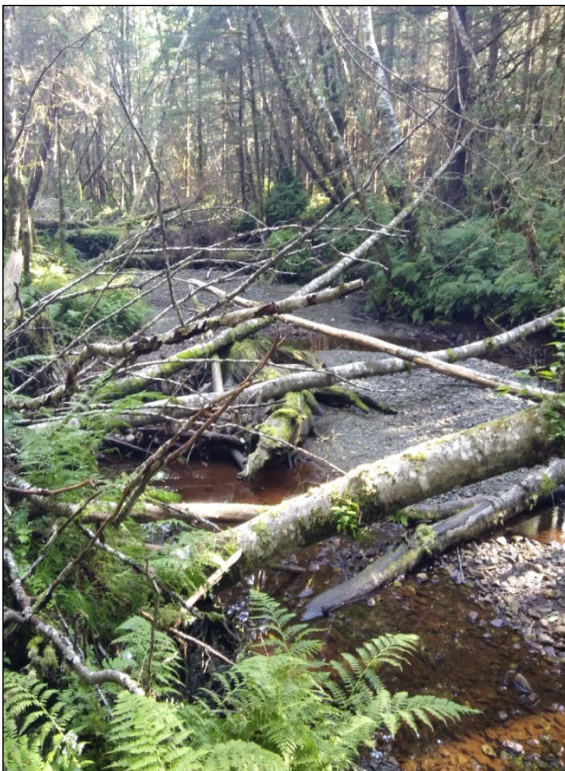
Figure 2. Upstream at waypoint 563.