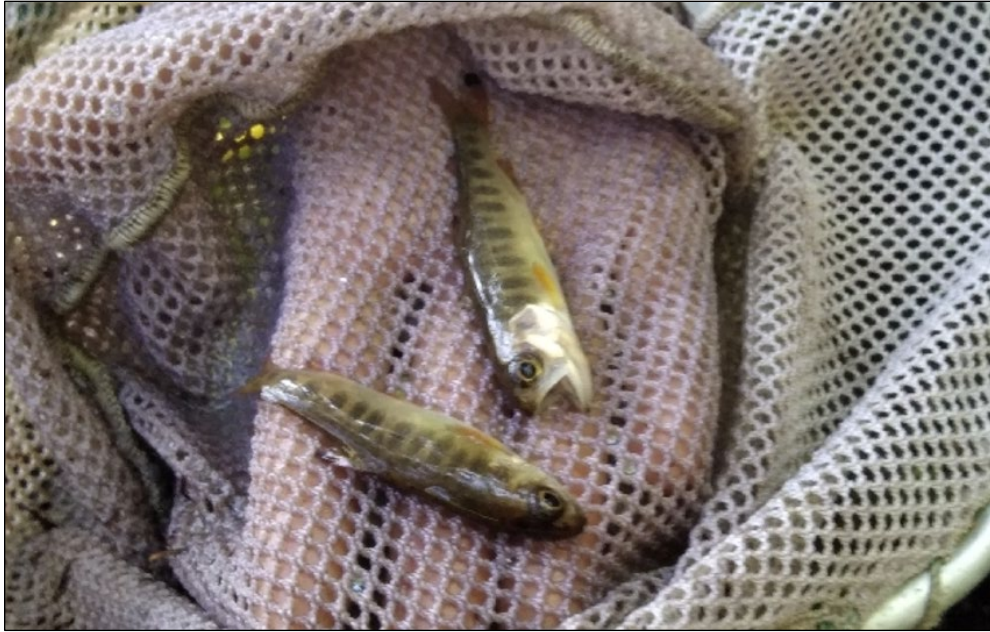
Figure 1. Juvenile coho salmon caught at waypoint 563.