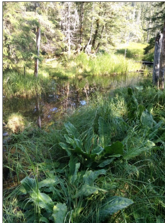
Figure 3. Ponded water at waypoint 562.